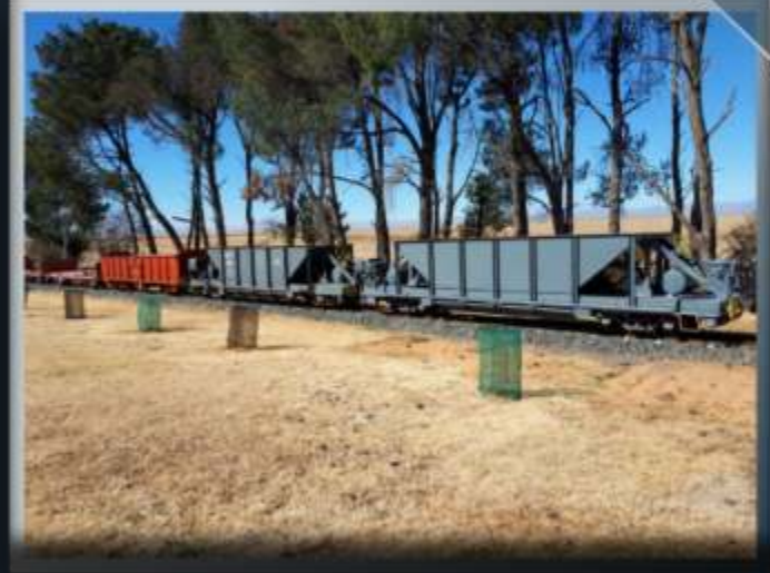
Below: The recently restored B wagons were painted with red oxide.