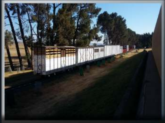
Below: Another cattle wagon being painted back into silver livery.