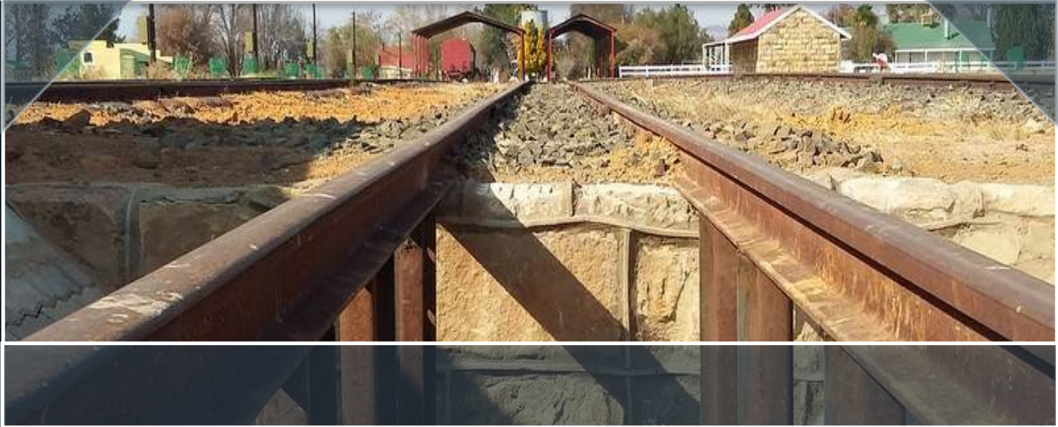
Below left: Len completed the ash pit in Hoekfontein Station Below right: This week we fitted new fan belts for the 91 class auxiliary exciter..